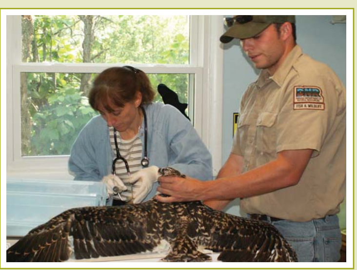
Veterinarian checking an Osprey/Indiana

they had not identified a "good way to get there." A habitat-based approach also avoided the polarization among interest groups that can accompany single species conservation efforts.